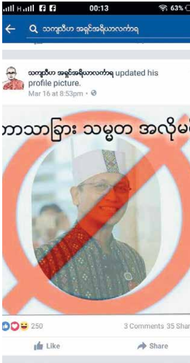
Anti-Vice President Van Thio screenshot.

In June 2016, ultra-nationalist monks gathered in Rangoon to mark the third anniversary of the group, and vowed to continue protecting “race and religion.” In July, the tide appeared to turn against Ma Ba Tha when the government-appointed monks’ body, the Sangha Maha Nayaka committee, sought to distance itself from the group, stating that Ma Ba Tha had not been created in accordance with the official procedures of the sangha. The NLD government set up a task force to prevent and mitigate interreligious violence, and Religious Affairs and Culture Minister Thura Aung Ko publicly promised legal action against Ma Ba Tha if the group kept “making problems with other religions.”