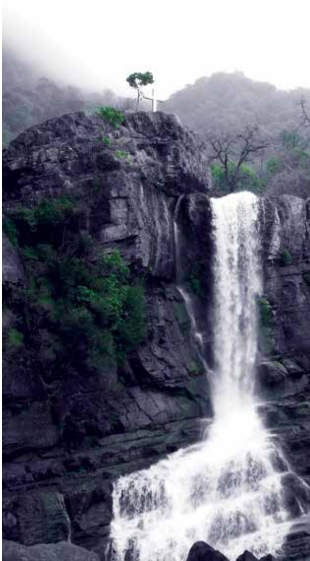
Cross, Matupi.

In Matupi in southern Chin State, an umbrella organization of churches applied for permission in 2012 to plant a cross on a mountain peak to replace one previously destroyed by the military, but did not receive a response. In 2013, locals planted a cross at a nearby waterfall to replace another cross destroyed by the military. Based on their earlier experience, they did not seek prior permission.