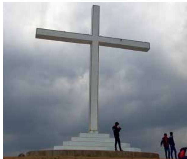
Calvary cross, Hakha.