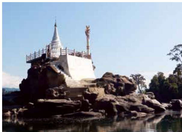
Nat Jawng. Photo: Kachinland Heritage Foundation