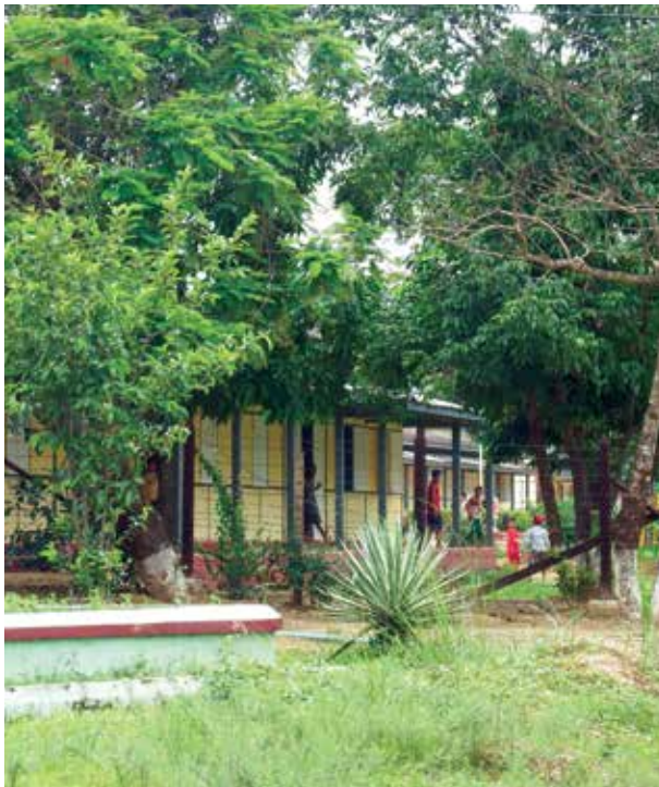
Na Ta La school, Khamti.

Buddhist worship. Buddhist literature and culture are taught on Saturdays, and on Sundays children are taught “Union Spirit,” which is essentially pro-military propaganda and includes singing nationalistic songs. Initiation into the monkhood or nunhood for a period every year is compulsory.