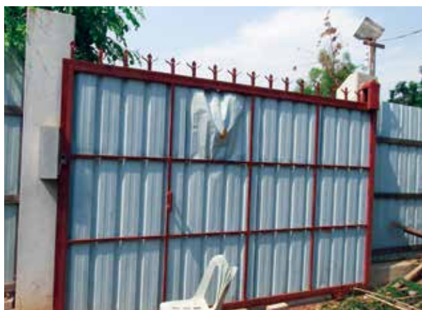
Damaged compound, Yesagyo.