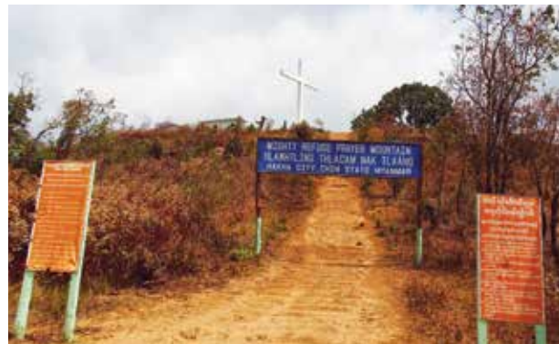
Calvary cross, Hakha.

For now, the cross is still standing and the pagoda has not been built, but this is due to significant public pressure rather than to any substantive change in policy or practice. Although it applied more than a year ago,