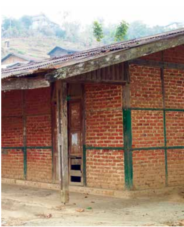
Ministry of Education high school building, Matupi.

in Christian worship. In addition, children follow a special compulsory curriculum, which sets the Na Ta La schools apart from mere “boarding houses.” Every morning and evening, children have to practice