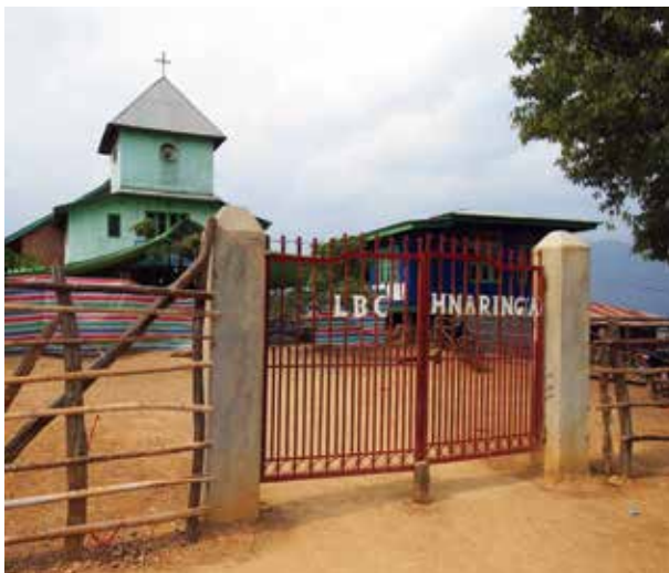
Lautu Baptist Church.

In predominantly Buddhist urban areas, the regulations are more strictly enforced. In Rangoon, new churches built in the past five to 10 years have been able to circumvent the restrictions on church-owned land outlined above by obtaining permission for a residential building instead. To remain inconspicuous and avoid any problems from the authorities, the church members refrain from using religious symbols or signboards on the building exterior. One Chin Baptist pastor explained, “If possible, of course we want to decorate the building with Christian symbols. For us, since we have been under this situation for so long, we no longer expect to be able to do that. We have different kinds of fear in our hearts still, so we can’t think about decoration like that yet.”