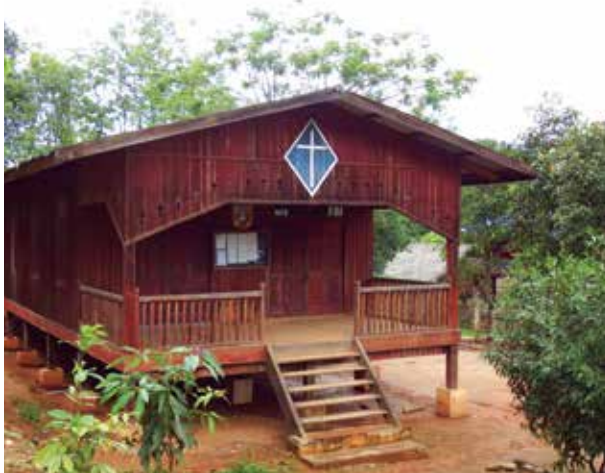
A Catholic church, Khamti.