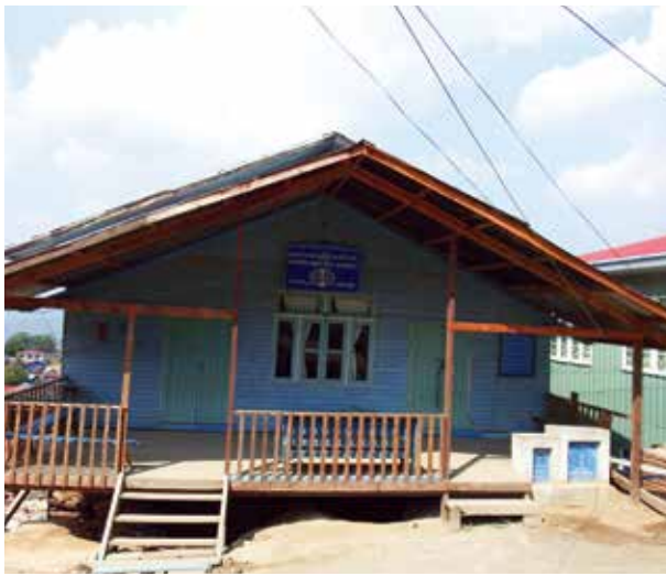
A Baptist church, Hakha.