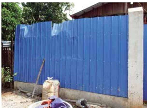
Damaged compound, Yesagyo.

Angered by the authorities’ apparent failure to take legal action against the pastor, Ma Ba Tha incited local Buddhists to stone the building and destroy property on three occasions, most recently in June 2015, for several days in a row. The pastor reported the attacks to the