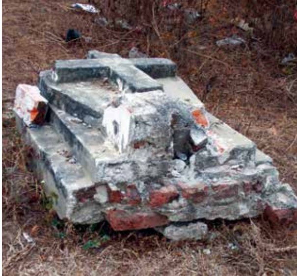
Toungphila cemetery site.

destroyed the Toungphila and Santha cemeteries, they disturbed remains at recent burial plots, as well as ancestral remains. As in many societies, in the Chin cultural tradition it is very important to take care of sacred sites and ancestral remains. A Chin civil society representative explained, “Cemeteries are sacred sites, we feel attached to the land. If someone removes or destroy the remains, it’s like making our ancestors die twice.” The communities held public protests and sought to take their complaints to the highest levels of government—citing a report by the parliamentary Land Acquisition Investigative Committee, which stated that acquisition of religious buildings and cemeteries should be avoided—but never received a response.