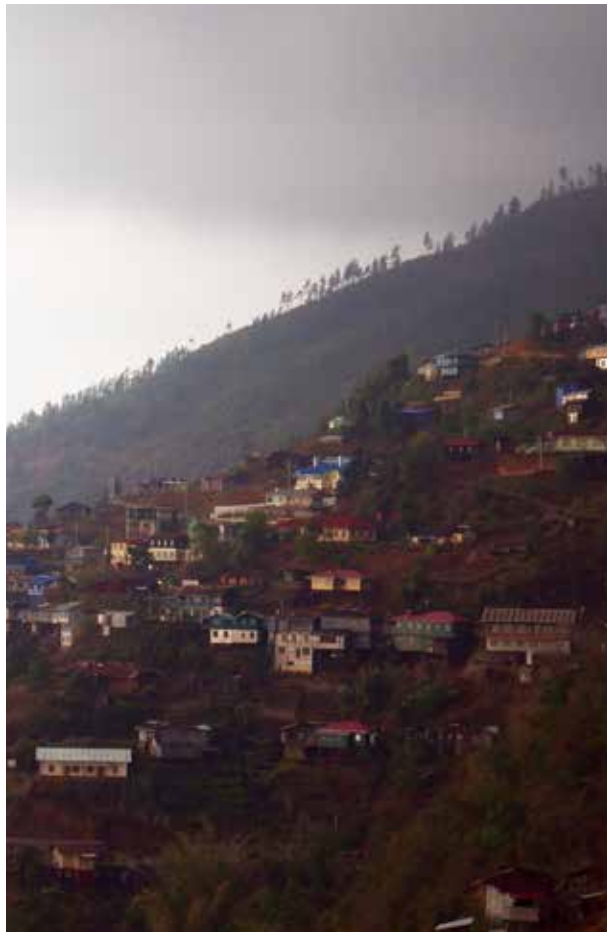
Falam town, Chin State.

Since March 2015, the Tatmadaw has sporadically clashed with ethnic armed group the Arakan Army