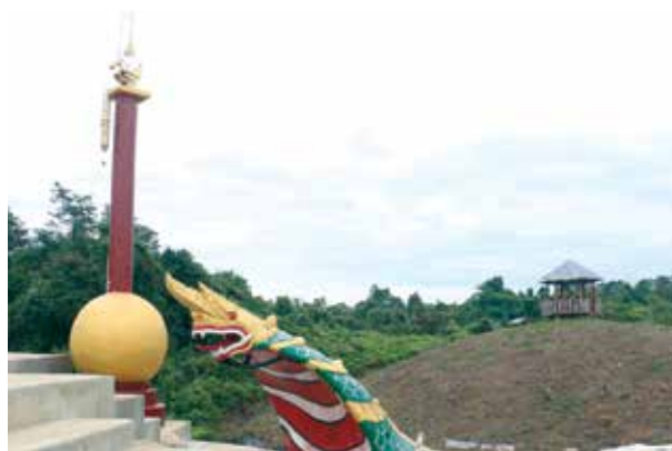
Machyang Baw site.

In the Naga area, local people in Tamanthi complained that the government is currently spending millions of kyats (Burma’s currency) on building monasteries in