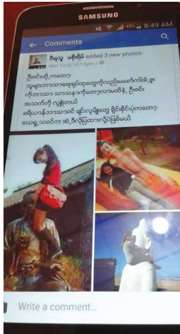
Facebook post by Wirathu.

fake inflammatory images targeting Muslims posted by Wirathu and others in the past. This malevolence was likely triggered by Chin Christian Henry Van Thio’s appointment as vice president. Other posts circulating on Facebook decried his appointment and were “liked” and shared multiple times.